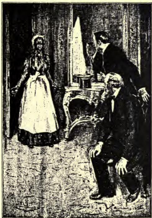
“ MISS LAURA AIN'T DAH, SAH ”